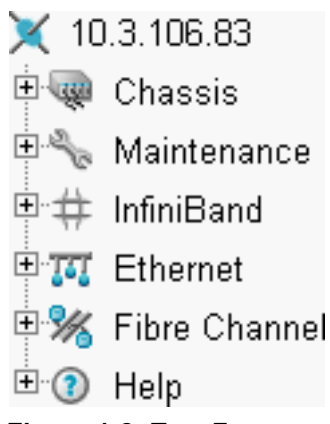
Figure 1-2: Tree Frame

The Tree frame appears on the lower-left-hand side of the CM display and provides a navigation tree that groups the functional branches of your device under icons. Figure 1-2 displays an example of the Tree frame.